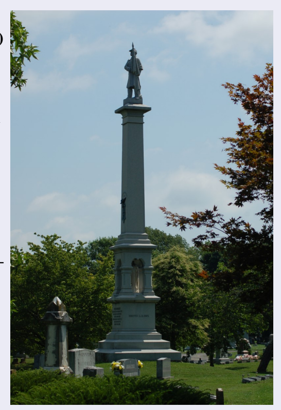
Maysville, Ky, G.A.R. monument.

The city of Lexington removed the two downtown statues of John Hunt Morgan and John C. Breckinridge on October 18, 2017, following Kentucky Attorney General Andy Beasher's determination that the statues did not fall under the jurisdiction of the Kentucky Military Heritage